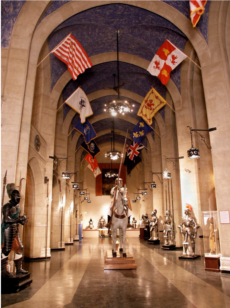
Figure 6.1: Since 1971 half of the Great Hall has been devoted to additional armor displays. 52